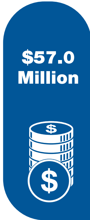
Total Community Benefit

As a not-for-profit health system, Valley Health does not pay federal income taxes. In lieu of tax dollars, the organization makes significant financial contributions in the form of Community Benefit. Valley Health's probable income tax liability, if it were a taxable entity, compared to what Valley Health actually contributed to the community it serves, is illustrated below. Had Valley Health been a taxable organization in 2016, the potential income tax liability would have been $43.1 million. The Community Benefit supplied by Valley Health was $57.0 million, 32 percent higher than its potential tax liability.