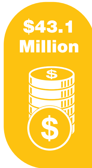
Potential Tax Liability

Navigating the complexities of securing health insurance through the Affordable Care Act Insurance Marketplace and the application processes for government assistance programs like Medicaid and Children's Health Insurance Program (CHIP) can be daunting. In 2016, Valley Health committed over $954,000 to provide financial counseling to help patients access needed healthcare resources.